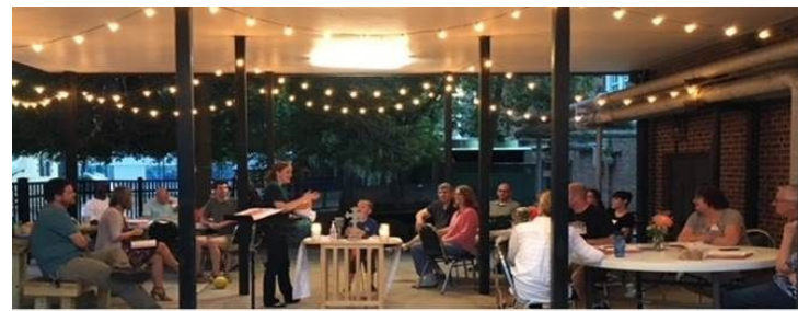
Worship on the Patio: Tuesday, Sept. 11 th 7pm

Following the children's message in the 9:00 service, kids in Pre-K4 through 2nd grade will go to Room 311 for RiverKids: Worship. This worship experience happens most Sundays with the exception of the first Sunday of the month and Unity Sundays.