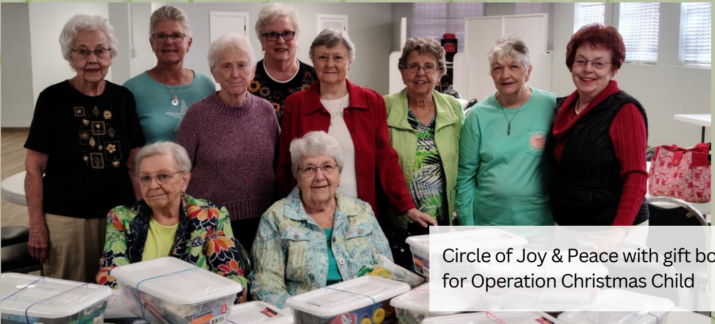
Circle of Joy & Peace with gift boxes for Operation Christmas Child

WIM, mark your calendars NOW. Saturday, December 3 at 9:30 a.m. an Advent brunch will be held at Beau Rivage for all circle members. Details will be shared by each circle chair with members. Hope to see you there to celebrate the coming of Christ and enjoy the fellowship.