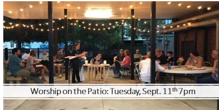
Worship on the Patio: Tuesday, Sept. 11 th 7pm

LAST gathering for Worship on the patio is this Tuesday.