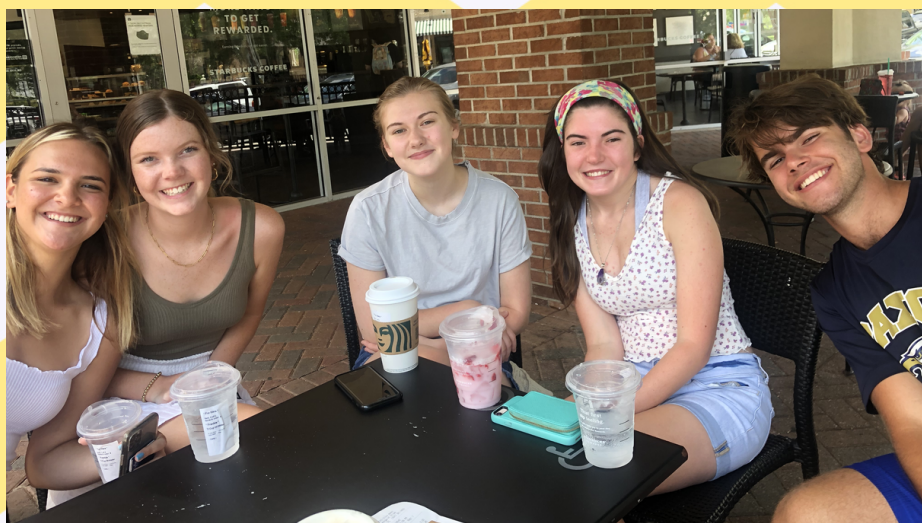
Some of our High School students gather for an impromptu summer coffee