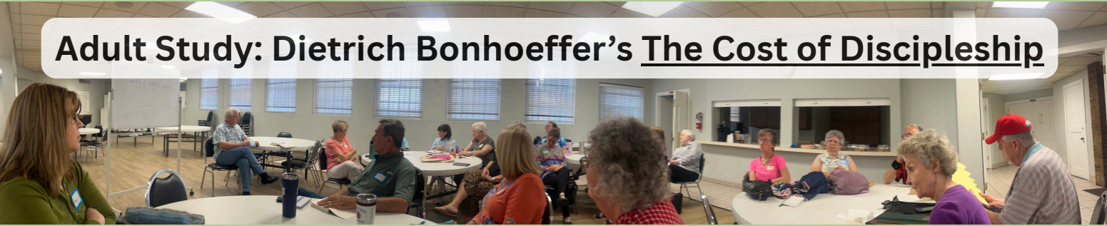
Adult Study: Dietrich Bonhoeffer's The Cost of Discipleship