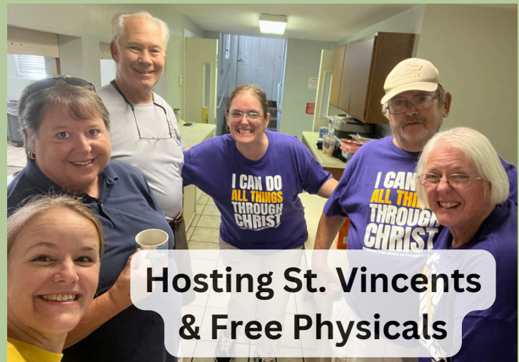
Hosting St. Vincents & Free Physicals