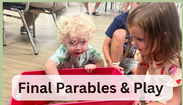
Final Parables & Play