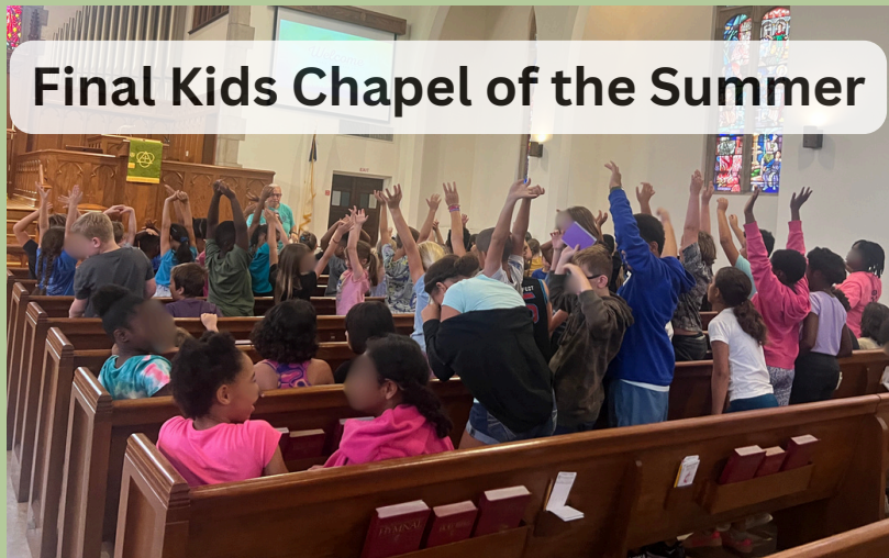
Final Kids Chapel of the Summer