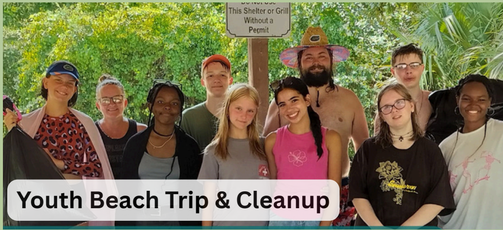
Youth Beach Trip & Cleanup