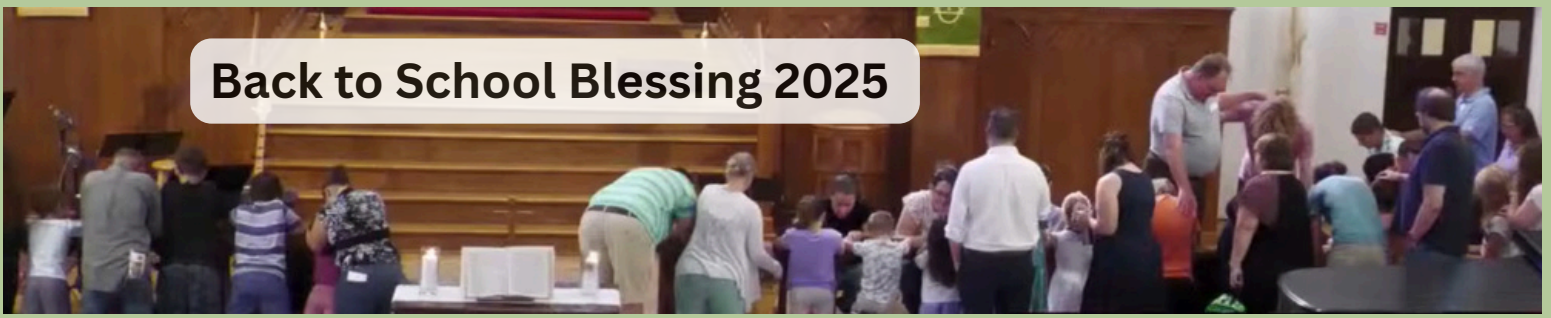
Back to School Blessing 2025