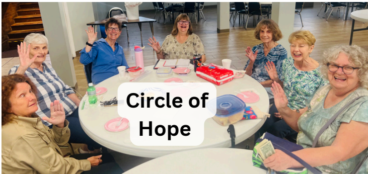
Circle of Hope