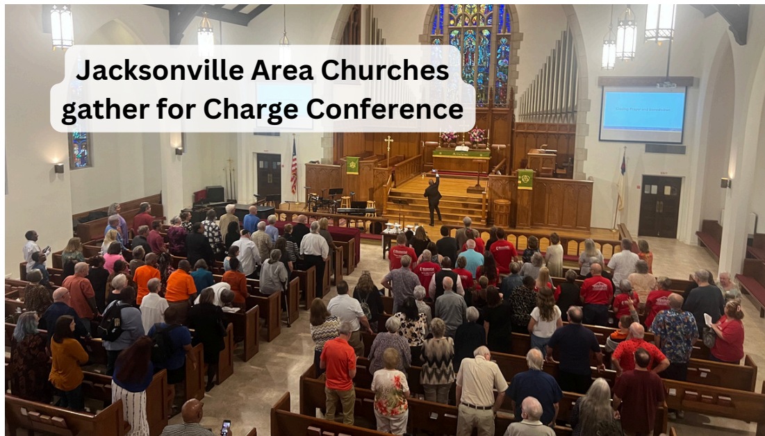
Jacksonville Area Churches gather for Charge Conference