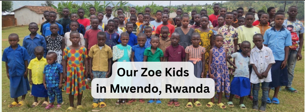
Our Zoe Kids in Mwendo, Rwanda

We have missional impact all the way in Rwanda! Our district (the 72 United Methodist Churches in North East Florida) is working together to support a Zoe Empowers group. Our 27 children and youth (above) in Rwanda have named themselves the Dukore Group (meaning “Work Together”). With our support, these kids will spend the next three years moving from poverty to self-reliance