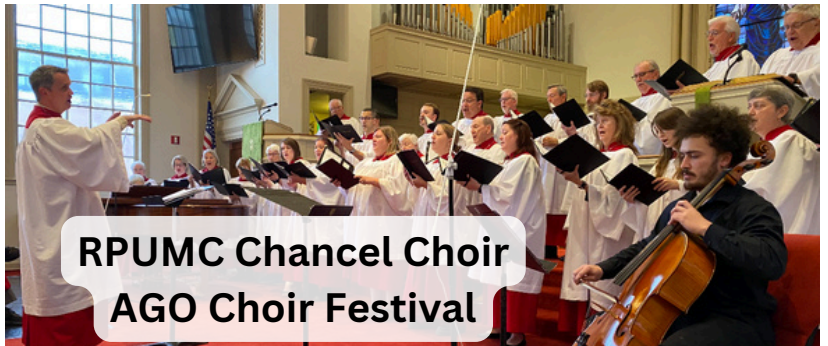
RPUMC Chancel Choir AGO Choir Festival